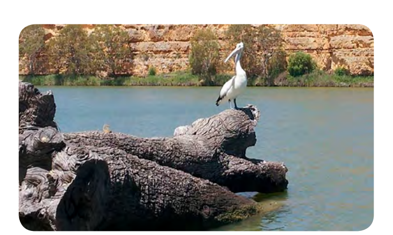
Protecting source water resources is important for more than just human well-being.

On-line information gathered from this project will be used to predict coagulant doses and powdered activated carbon (PAC) application in water treatment processes. UNSW has collaborated with Xylem Analytics Australia and YSI, among many others, to bring the full power of next-level monitoring equipment into play.