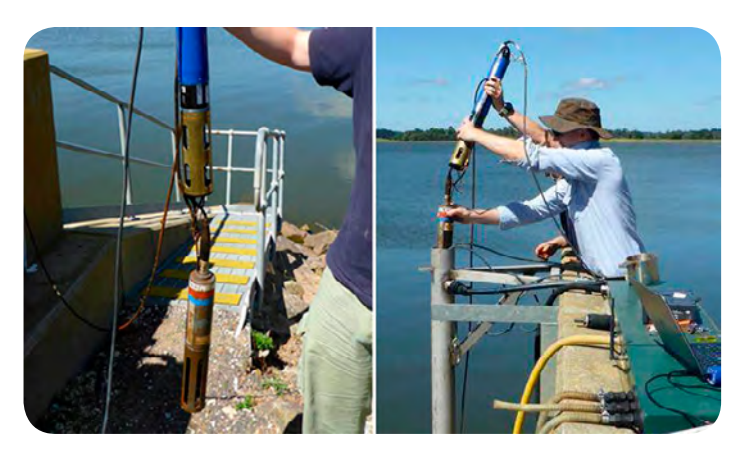
A YSI 6820 suspended beneath an EXO2. Both feed into a CR1000 datalogger which transmits data to an online SCA database.

The project collaborators, aiming to meet water quality guidelines during cyanobacterial blooms, are developing a protocol for the application of a real-time analyzer to obtain information. This information will guide the application of treatments that will combat the blooms.