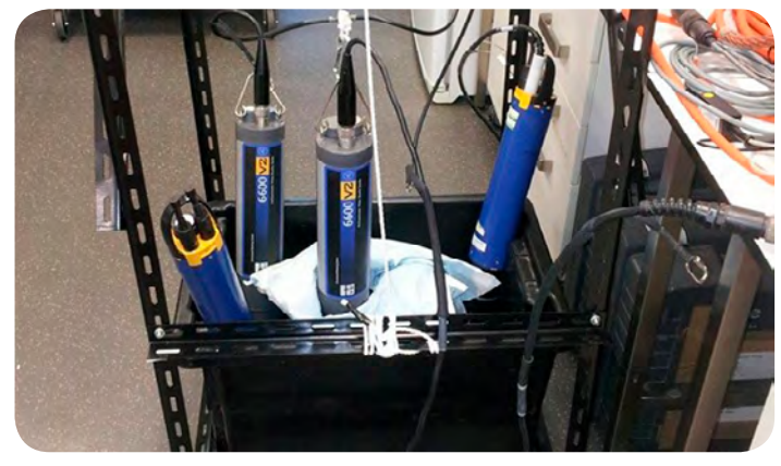
EXO2 Sondes and Legacy 6600-V2 Sondes in pre-deployment quality testing.