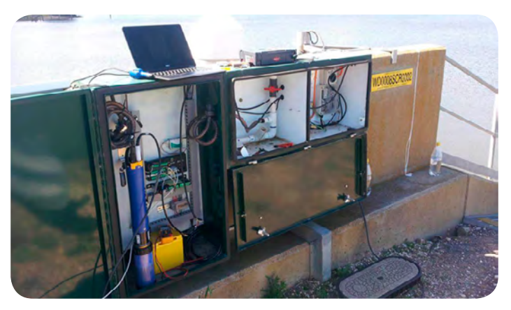
Housing system to protect UNSW's critical water monitoring investments and data.

YSI, a Xylem Brand manufactures environmental monitoring instruments and systems. Formerly known as YSI, the group is a market leader with a reputation for high levels of accuracy and reliability.